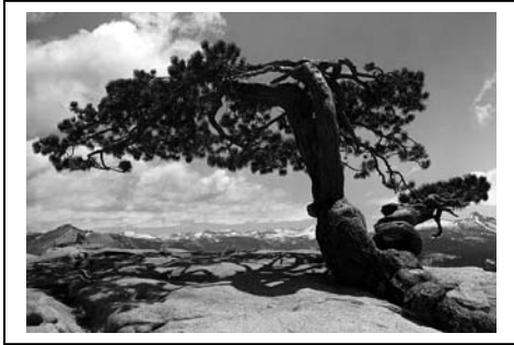
ANSEL ADAMS NEGATIVE